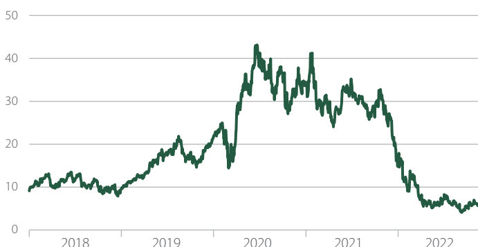
Exhibit 2: Shopify, Inc. Class A - P/Sales - Next 12-Months

However, after a period of phenomenal performance, the market placed a premium valuation multiple on the company at the same time economies started to reopen and interest rates started rapidly rising thanks to surging inflation. Shopify's growth suffered as consumers headed back to physical stores, while its stock suffered significant multiple compression.