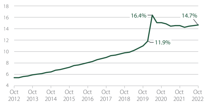
Exhibit 3: E-Commerce Retail Sales as a Percent of Total Sales (%)—U.S.